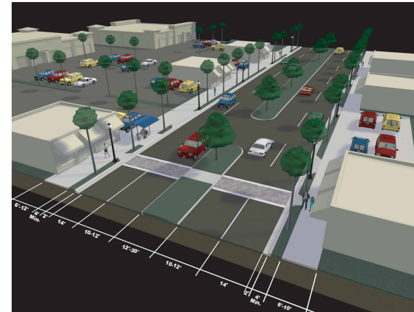
RAISED MEDIAN, WIDE OUTSIDE TRAVEL LANE

* Also, outside travel lane and bike lane are combined (no bike lane) and outside lane dimensioned at 14'.