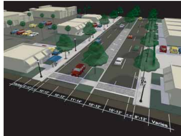
CONTINUOUS LEFT TURN LANE, BICYCLE LANE