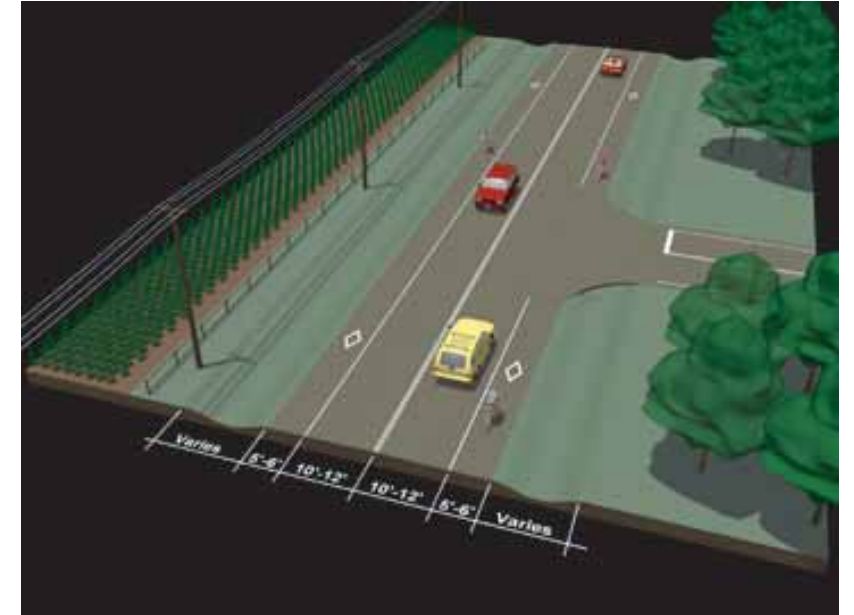
BICYCLE FACILITY IN ROADWAY